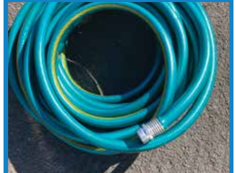
(1) 50' Garden Hose