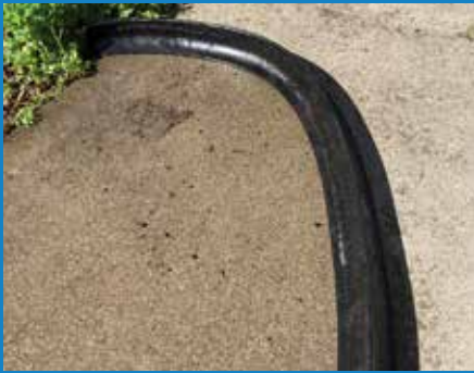
(1) Temporary Berm