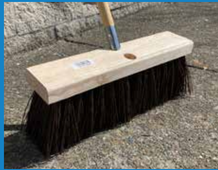
(1) Push Broom