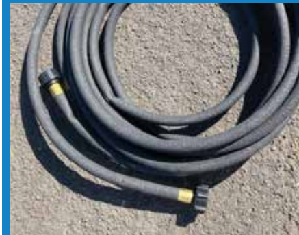
(1) 25' Soaker Hose