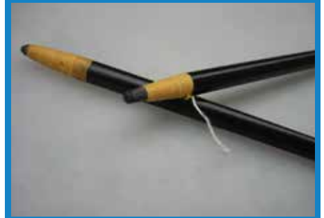
(1) Grease Pencil for Checklist