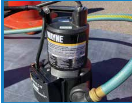
(1) WAYNE Submersible Pump