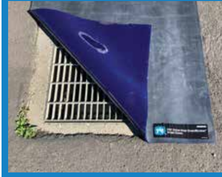
(1) Storm Drain Mat