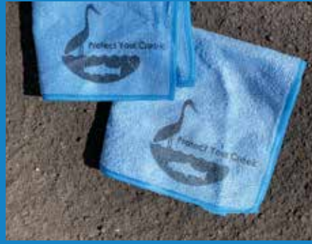
(2) Shop Rags