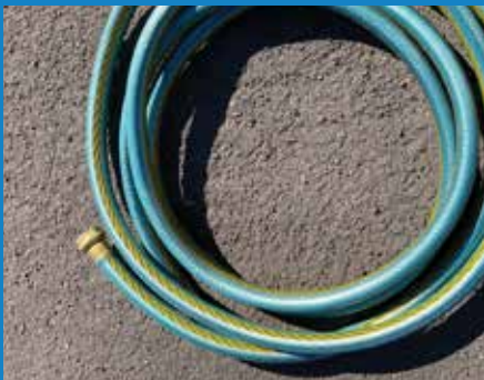
(1) 15' Garden Hose