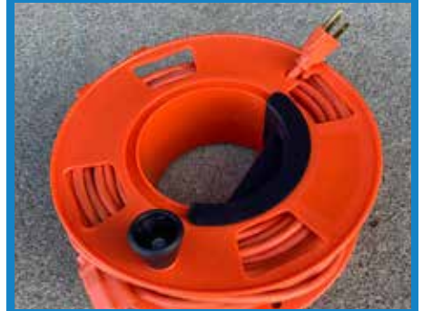
(1) 50' Extension Cord