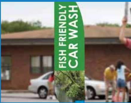
(2) Fish Friendly Signs