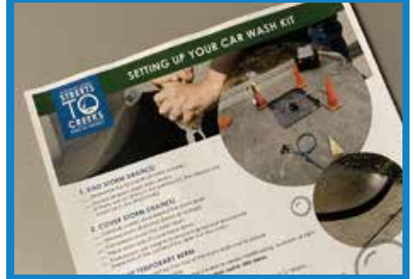
(1) Laminated Instruction Sheet