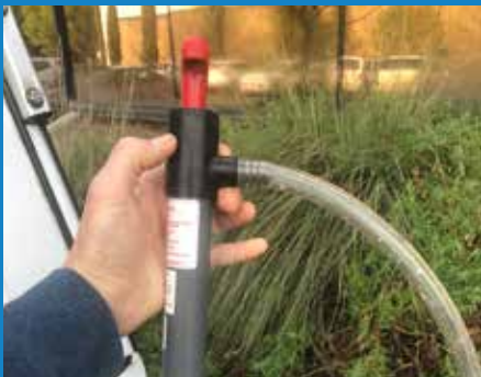
(1) Hand Pump