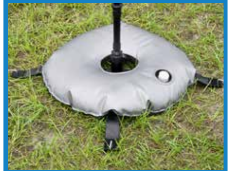
(2) Sign Weights