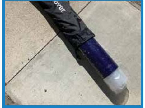
(1) Case for Storm Drain Mat