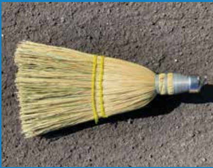
(1) Whisk Broom