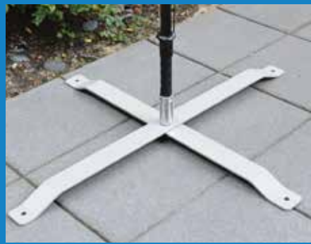
(2) Sign Bases