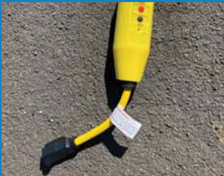
(1) In-Line GFCI