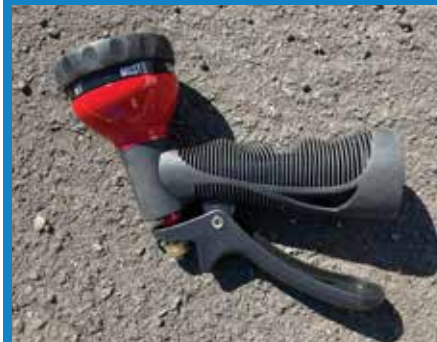
(1) Water-Efficient Nozzle